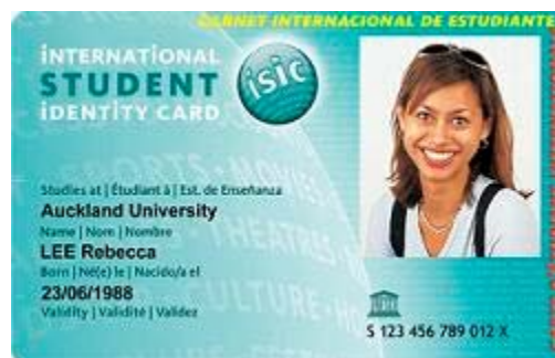
International Student Identity Card ..... your student lifestyle card

A great way to keep in touch with your family and friends while abroad.