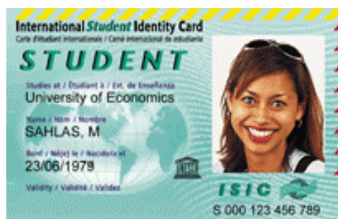
International Student Identity Card

A great way to keep in touch with your family and friends while abroad.