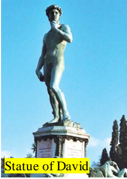
Statue of David

Our tour starts discovering the city from a panoramic point of view considered one of the most beautiful and romantic in the World: the Piazzale Michelangelo. From here we can have a complete view of the city and of the green landscape around it. The tour will resume going down into the heart of Florence to the Accademia Gallery, where it will be possible to admire the original version of David by Michelangelo, the unfinished "I Prigioni", "San Matteo", "Pietà di Palestrina" and other masterpieces. The tour will continue through the historical streets of Florence, and will lead us in front of the Duomo where the guide will explain from the outside Giotto's bell tower, the Baptistery with its golden bronze doors including the famous Porta del Paradiso and, lastly, the Cathedral.