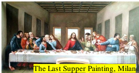
The Last Supper Painting, Milan

Guided bus and walking tour for a panoramic view of the city with a two-language speaking tour guide. The 1-hour walking tour includes a visit to La Scala Opera House, Duomo and the Vittorio Emanuele II Gallery. This tour includes also a guided visit to "The Last Supper", the world-famous painting by Leonardo da Vinci, located near the Church of Santa Maria delle Grazie.