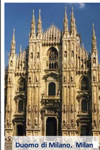
Duomo di Milano, Milan