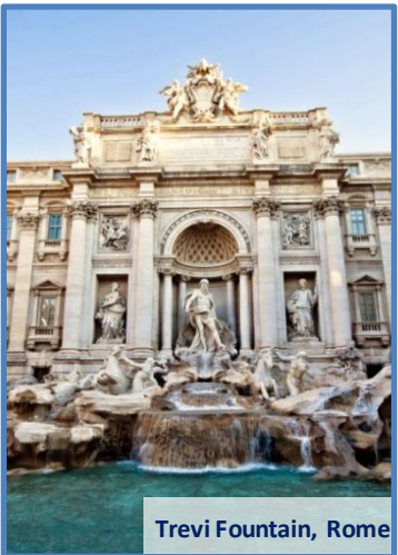
Trevi Fountain, Rome