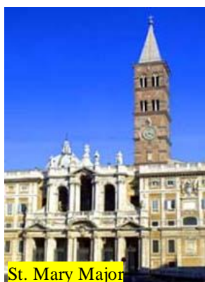
St. Mary Major

Piazza Barberini with the Triton Fountain by Bernini. » St. Mary Major (visit) the most beautiful Basilica dedicated to Mary Mother of Christ with gorgeous mosaics and the relics of Jesus' cradle. » St. John's in Lateran (visit) cathedral of Rome and first Papal residence with masterpieces from Middle Ages to Baroque. Stop at the Holy Stairs. Through the first part of the Appian Way, with a view at the Domine Quo Vadis Chapel, we reach the Catacombs (visit), the ancient underground Cemeteries and extraordinary expression of faith of the early Christians. Return to hotels or nearest point.